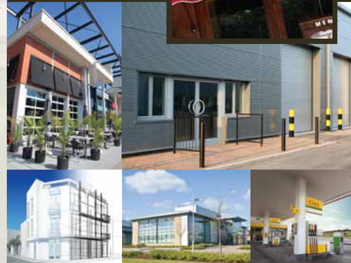
Picture yourself here!