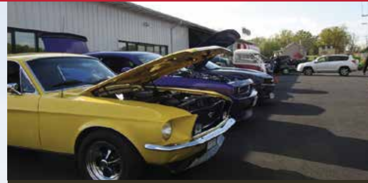
Crusin For Heroes – 4th Saturdays during Summer